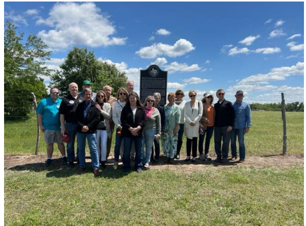
Many former BI employees were there for the dedication