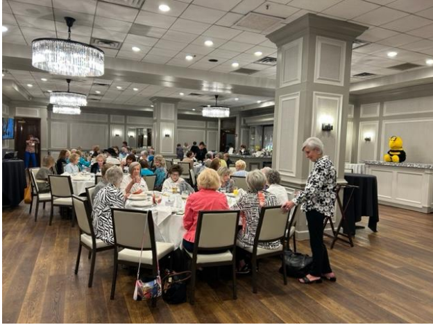
Newly decorated ballroom at Maggioni's