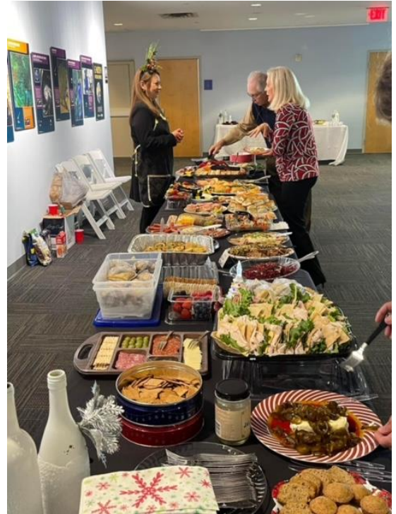
The B's know how to party!!