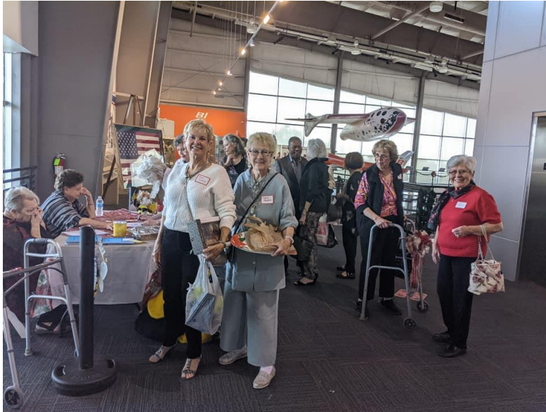
Check-in Table – Flight Museum Upstairs near the Braniff Exhibit